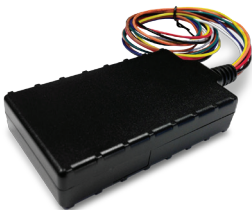
Uplink GPS HW