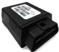
Uplink GPS OBD